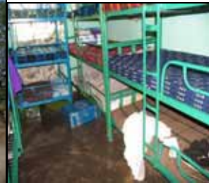
Figure 3 Bunk Beds

We have enjoyed serving you as well as making a difference to a child and a village in Uganda.