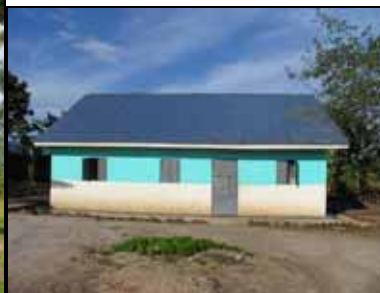
Figure 2 Boys Dorm