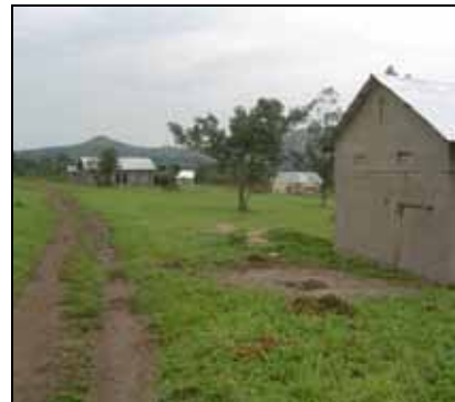
The HCCP Project Oct 2005 - TO - The HCCP Project June 2007