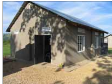
The School Dining Hall built in 2007

Well over 300 children are now attending the school, which currently provides instruction for primary grades 1-6. Construction had begun on a second school building that was opened later last year. Children who are sponsored through the SURGE Program are automatically enrolled in the school. Besides receiving a quality education, the $25/month (current) sponsorship fee also provides each child with a daily hot meal, shoes, medicine and a school uniform. Children in need can also be boarded at HCCP for an additional $25/month.