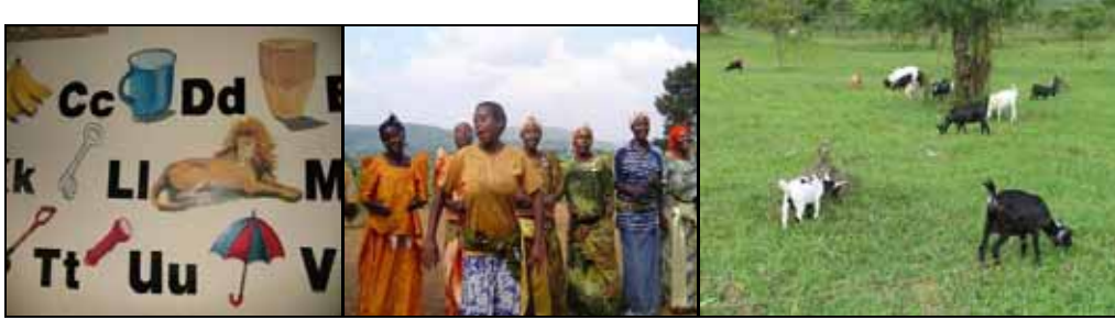
Figure 1 - Baby Class Paintings in school