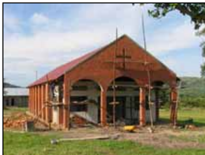
Figure 1 Bulanga Church

Thank you to all those who have faithfully given and YOU as a sponsor and supporter and member have made so much difference to their lives and their surrounding communities.