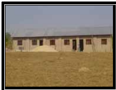
2 nd building of School Classrooms being built on HCCP Project 2006